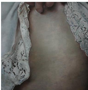
lace oil on linen 41 x 41cm, 2015 NFS