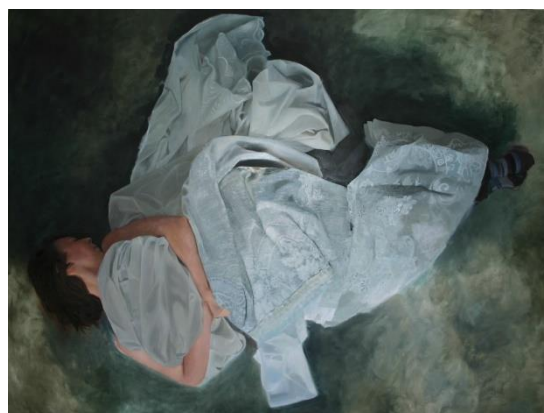
Dreamweaver (Kate) oil on linen 157 x 208cm, 2018 $2,600