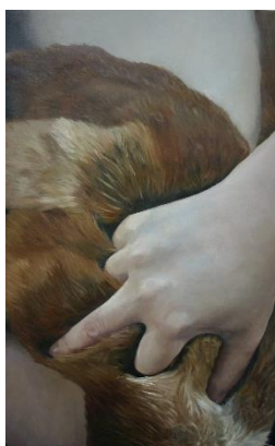
fur oil on linen 96 x 61cm, 2019 $500