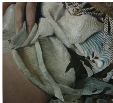
gold oil on linen 61 x 66cm, 2019 $450